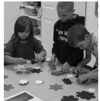
Anniversary Circle Fund grantee, The Discovery Space of Central Pennsylvania STEAM Project.